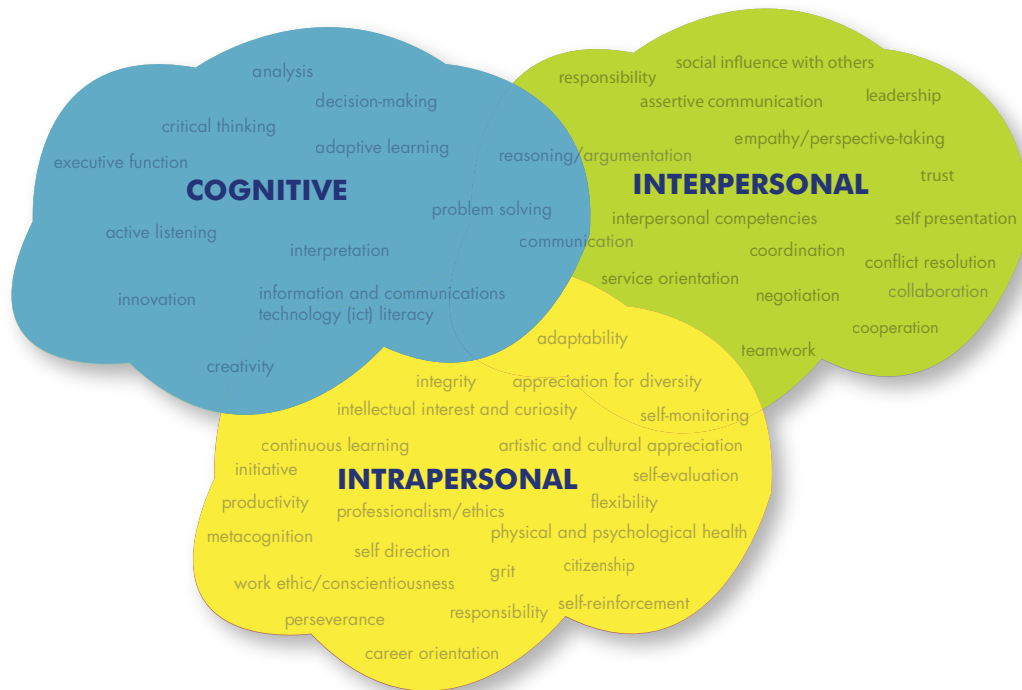
“21st century skills” grouped into three broad domains

skills that can be applied to a range of different tasks in various civic, workplace, or family contexts, the committee views these competencies as aspects of expertise that are specific to – and intertwined with – knowledge of a particular discipline or subject area. The committee uses the broader term “competencies” rather than “skills” to include both knowledge and skills.