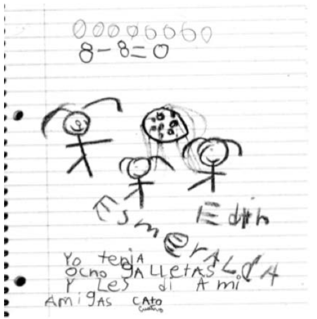
Figure 3: Students create their own word problems to pose to others.

Figure 2: Supporting students to transition from concrete to abstract mathematical concepts (Taken from Figure 1 in Musanti & Celedón-Pattichis, 2013, p. 52)