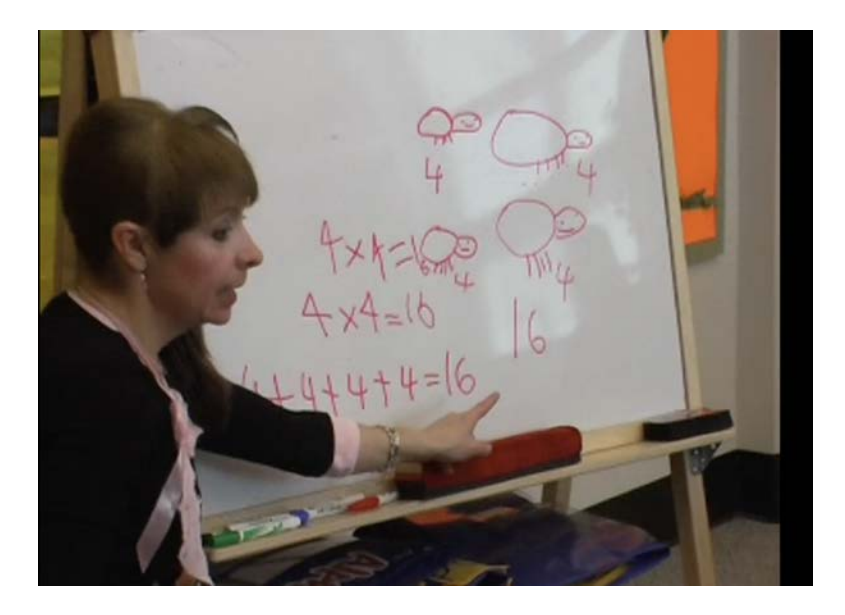
Figure 1: Scaffolding to make connections from oral counting to pictorial to symbolic representations

education, to communicate his solution. The student began explaining his solution by drawing four toy horses and counting each leg verbally and by pointing to each leg as he counted, and then writing an equation (4 \times 4 = 16) that connected to his pictorial representation (see Figure 1). At this point, I should note that this was the first time that this particular student was making sense or appropriating the multiplication symbol. Because not all students were using the multiplication symbol yet, the teacher used the details of the story as well as the student's explanation to scaffold for the rest of the class what the multiplication symbol meant, (i.e., 4 + 4+ 4 + 4 = 16), an equation that most students were familiar with in this mathematics classroom. She pointed to the student's pictorial representation and connected each detail to the representation using repeated addition.