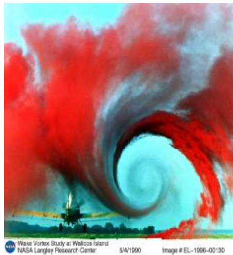
NASA Wake Vortex Study at Wallops Island NASA Langley Research Center 5/4/1990 Image # EL-1996-00/30

Upon its release in early January, the prepublication report may be downloaded for free from the National Academies website. Please visit http://www.national-academies.org/aseb/ for access to the report. Hard copies may be requested by contacting Sarah Capote ( scapote@nas.edu ; 202-334-3827). The final report is expected to be published by the National Academies Press in March 2008.