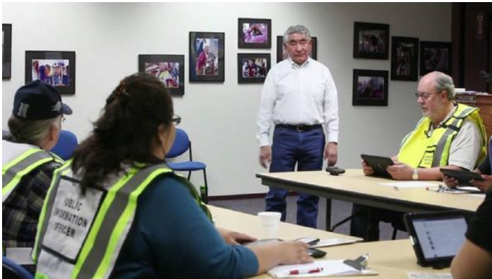
Photo: Fallon Paiute-Shoshone Tribal Administration doing emergency training, June 2012

Community resilience begins with strong local capacity.