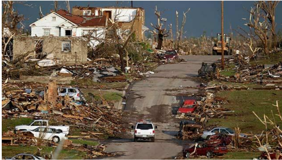
Photo: Joplin, MO after the May 22, 2011 tornado