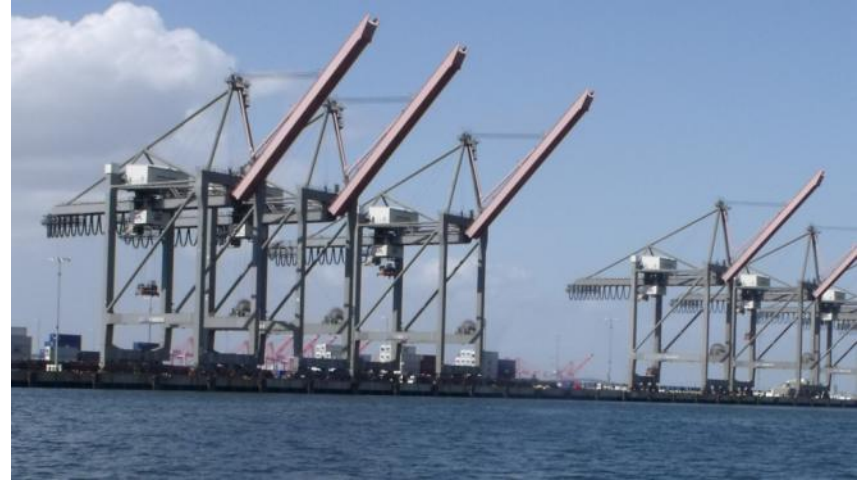
Photo: Port of Los Angeles upgrade to address risk and sustainability

A necessary first step to strengthen the nation’s resilience and provide the leadership to establish a national “culture of resilience” is a full and clear commitment to disaster resilience by the federal government.