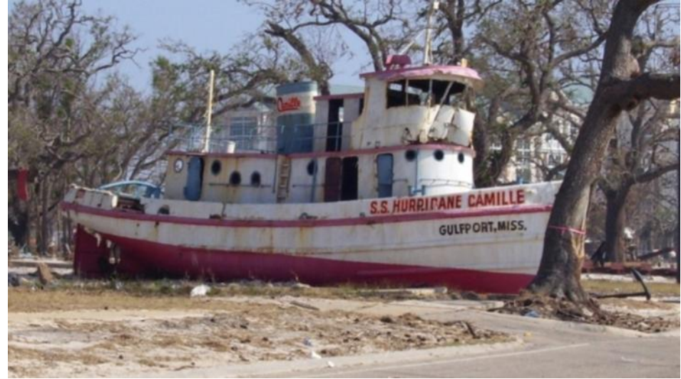
Photo: S.S. Hurricane Camille in Gulfport, MS in October 2005 after Hurricane Katrina

Existing loss and inventory databases in the United States are useful for certain kinds of analyses, but improvement in measurements, accuracy, and consistency are needed.