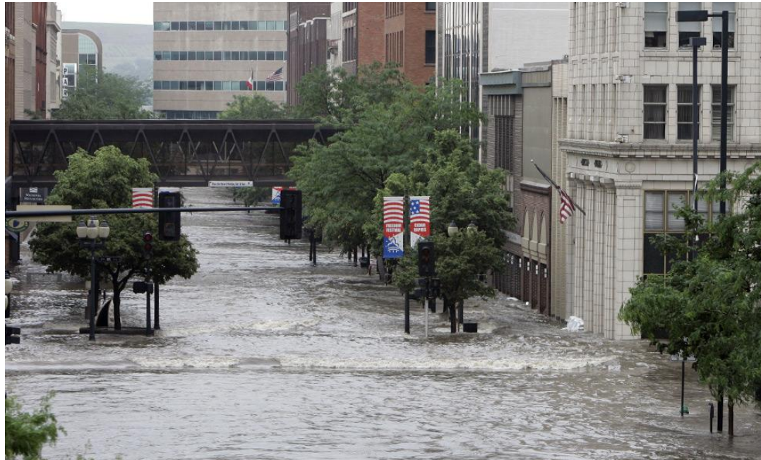
Photo: Cedar Rapids, IA during the 2008 flooding

The ability to prepare and plan for, absorb, recover from, or more successfully adapt to actual or potential adverse events