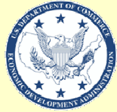
The Economic Development Administration