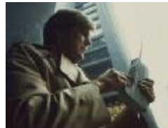
Man using Motorola Dyna TAC portable cellular telephone prototype, 1973.