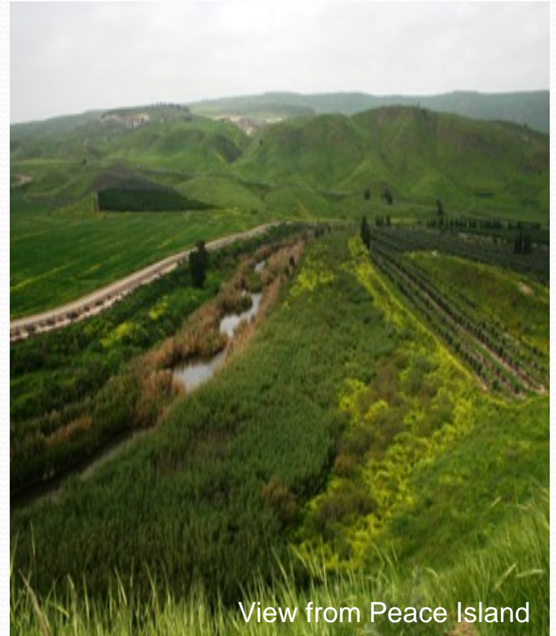
View from Peace Island