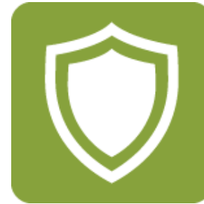
Safety / Crime Victims