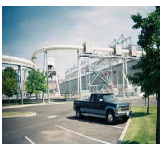
The Juvenile Bypass System at McNary Dam on the Columbia River

The results from Eva's research project on the avoidance behaviour of actively migrating fall Chinook salmon to flow accelerations showed that the velocity gradient over the body length of the fish, at the instant at which smolts displayed an avoidance, response was similar over the range of accelerating flows tested. Results from her study present the first quantitative information about the avoidance behaviour of fish to flow acceleration and should provide data needed to help engineers and biologists develop effective systems to alleviate anthropogenically altered flow regimes. Furthermore, the devised experimental setup provides a valuable means to test worldwide the effects of accelerating flow on any downstream migrant fish species.