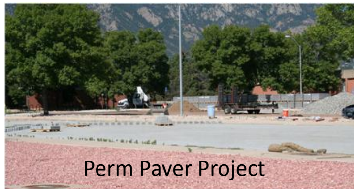
Perm Paver Project