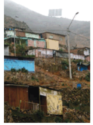
View larger version: <u>In this page</u> <u>In a new window</u> Urban forestry. Residents of this slum settlement are hoping to use fog water to reforest the hill above their homes.

Lummerich and Tiedemann now say they have improved on Schemenauer's standard model. Alimón's latest Eiffel Tower design, located above a community near Luna's, is a three-dimensional system. The double layer is