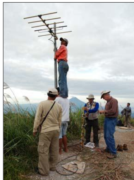
VDAP and CVGHM scientists install a seismic station to monitor volcanic activity in North Sulawesi.

Indonesia is the world's most volcanically active nation, with numerous eruptions each year and several million people living on the flanks of the volcanoes. Currently, VDAP's largest capacity-building project is conducted in partnership with the Indonesian Center for Volcanology and Geologic Hazard Mitigation (CVGHM). USGS collaboration with CVGHM's predecessor, the Volcanology Survey of Indonesia, dates back to the 1980's. At that time USGS helped evaluate hazards and establish monitoring at several of the highest-risk volcanoes, such as Merapi, located in the suburbs of Yogyakarta (metropolitan area population, 1.6 million). Following a hiatus of 20 years, at the invitation of CVGHM and with support of OFDA, VDAP returned to Indonesia in 2004 to help build a new regional volcano observatory in the North Sulawesi region. Over the past seven years, CVGHM and VDAP have built what is now one of the best monitoring networks in the country, with real-time seismic monitoring of the 10 active volcanoes in place and signals relayed in real-time by satellite and internet to CVGHM offices in Bandung, Java. In 2006 VDAP