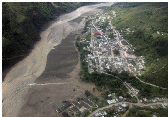
Eruption-generated debris flow overran portions the town of Belalcazar, Colombia approximately 15 miles downstream of Huila volcano on 20 November 2008. Accurate forecasts and warnings triggered evacuation of the 4000 residents, saving lives and property.