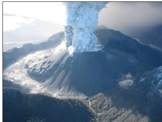
Gas, ash, and steam erupt from the growing lava dome in the crater of Chaitén, southern Chile, May 26, 2008.

Chile has within its borders more than 122 active volcanoes, only a handful of which have any monitoring in place or modern hazard assessments completed. The eruption of Chaitén spurred the Government of Chile to implement a new national plan to address its considerable volcano hazards. The resulting Red Nacional de Vigilancia Volcánica (RNVV) is modeled directly on the USGS National Volcano Early Warning System (NVEWS), an element of the USGS science strategy for natural hazards.