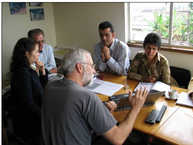
USGS and INGEOMINAS personnel meet to define alert level system for Huila volcano, Colombia. February 2007.

Colombian volcanoes. VDAP will continue to work with INGEOMINAS on volcano hazard mitigation in this important South American country.