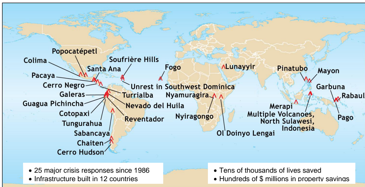
Map of VDAC deployments 1986 - 2011

The Volcano Disaster Assistance Program is a cooperative partnership of the USAID Office of U.S. Foreign Disaster Assistance (OFDA) and the U.S. Geological Survey (USGS). Founded in 1986 following the 1985 Nevado del Ruiz (Colombia) volcanic catastrophe wherein more than 23,000 people perished needlessly, VDAC works by invitation to reduce volcanic risk, primarily in developing nations with substantial volcano hazards. The majority of emergency responses and capacity building projects occur in, but are not limited to, Pacific Rim nations. To date, the single most successful VDAC operation was its response with the Philippine Institute of Volcanology and Seismology to the reawakening and subsequent eruption of Mount Pinatubo in 1991. This response alone saved 20,000 lives, including U.S. military personnel at Clark Air Base, and a conservative estimate indicates that at least 250 million dollars in tangible assets were removed from harm's way ahead of the eruption 1 .