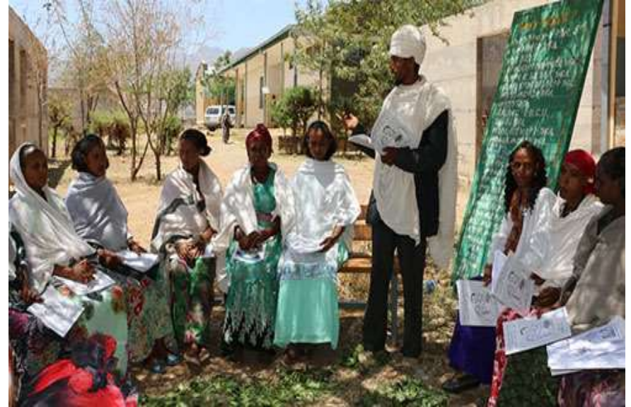
Photo Title: A priest speaks with pregnant women about delivering in a health facility People in photo: Pregnant women and a priest