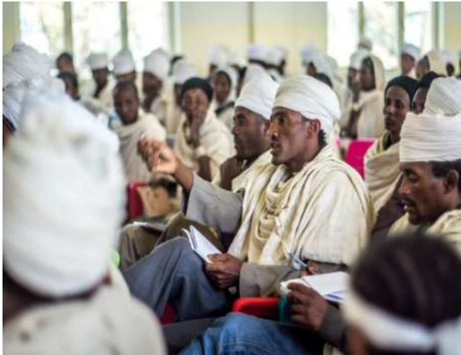
Photo Title: Priest and HDA on training People in photo: Priests and HDA